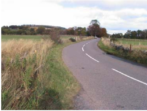
Fig. 5 : visibility to NE of access lane