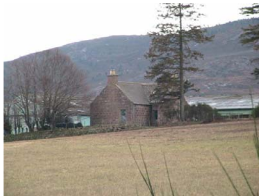
Fig. 4 : Existing farmhouse at Galton