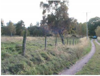
Fig. 2 : proposed site adjacent to existing laneway (western boundary).