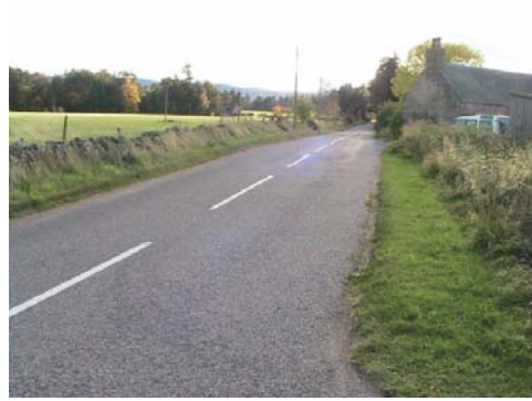
Fig. 6 : visibility to SW of access lane