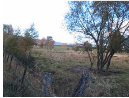
Fig.3: proposed site as viewed from the western approach (southern boundary)